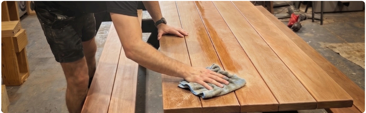
Wiping a freshly oiled Premium Hardwood top. Apply a quality outdoor timber oil on a dry, mild day, allow it to absorb, and wipe away any excess.