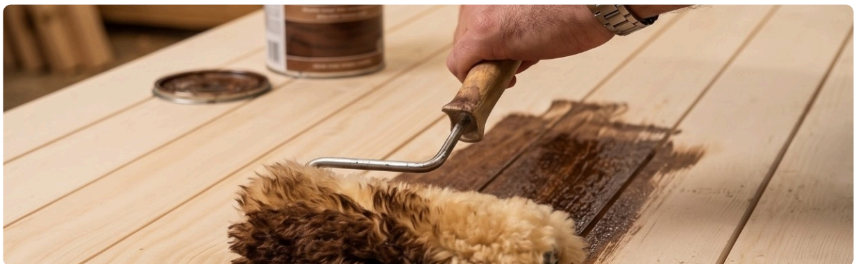
Applying a wood stain to a Classic Pine top. Surface preparation (light sand, wipe, dry) before re-staining helps the new finish bond evenly.