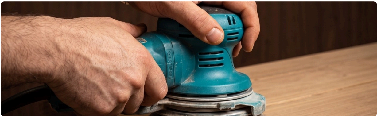
Light sanding hardwood with a random-orbit sander before re-oiling. Surface preparation removes weathered fibres, raised grain and surface contamination so the new finish bonds cleanly.