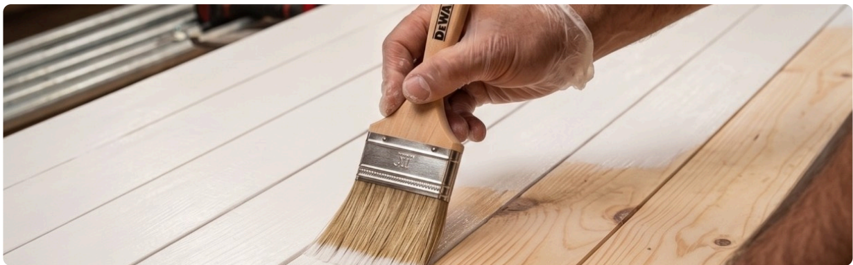
Applying outdoor-grade paint to a freshly prepared Auscraft surface. Even coverage on edges, end-grain and the underside is what keeps moisture out of the timber.