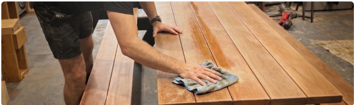
Routine cleaning with a soft cloth and mild soapy water. Regular cleaning is the first step in every care routine across all Auscraft ranges.