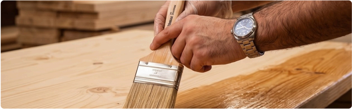
Brushing a quality outdoor coating onto a pine surface. Inspect annually, re-coat when the surface dulls or shows wear.